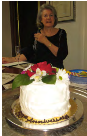
Oklahaven's Board of Directors begins 50th Anniversary Celebration

JULY – Invited to be one of the Lyceum Speakers for New Zealand Chiropractic College and presented to their students