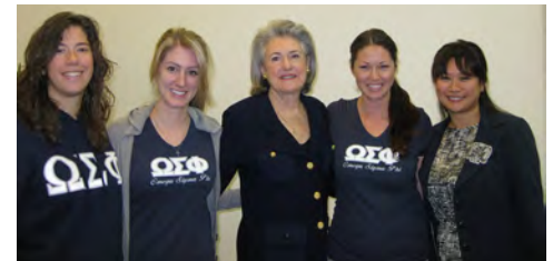
Life West Sorority - Omega Sigma Chi