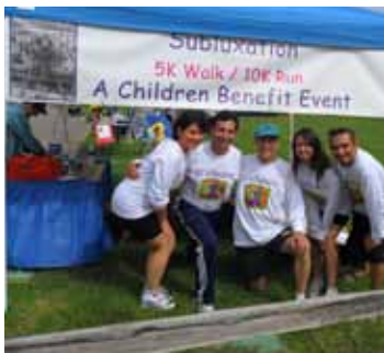
Subluxation Benefit Walk/Run in the San Francisco Bay area, California.