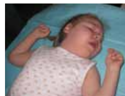
Patients in Russia.