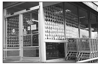
Hearts for children and chiropractic hanging in the "Wild Oats" health food store in Tulsa, Oklahoma.

"Have A Heart" moved into our community, the Wild Oats Health Food Store in Tulsa, Oklahoma