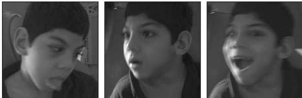
Delights in sitting! Holding his head up, able to give eye contact with more facial expression especially his tongue.