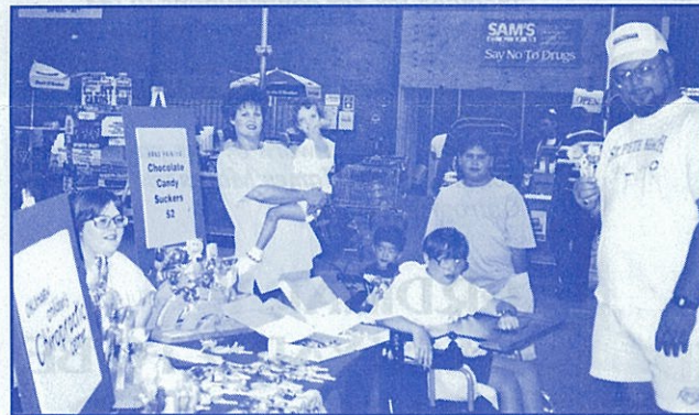
Board members and parents help the children at Sam's.