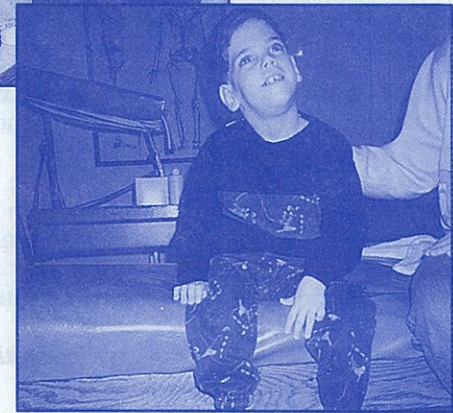
Top: First Visit Center: One Month Later Bottom: Four Months Later